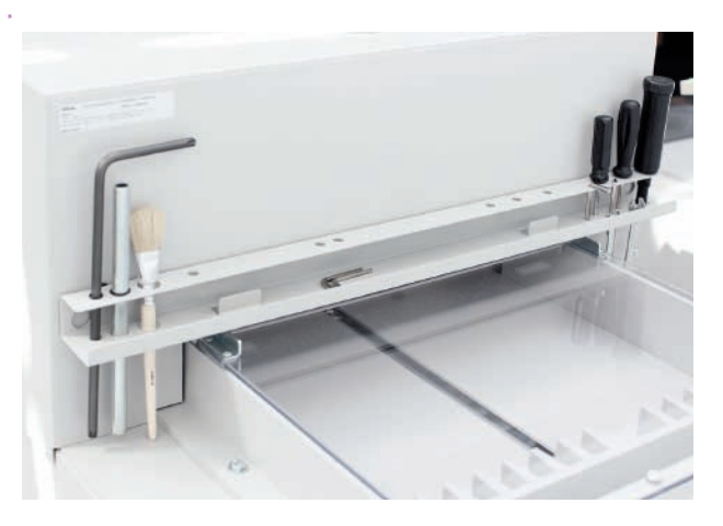
DROP-IN TOOL HOLDER Convenient, drop-in tool holder is located on the rear of the machine and keeps all tools necessary for routing maintenance (including blade changes) within easy reach.