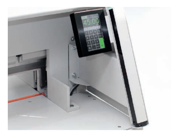
IR LIGHT BEAM SAFETY CURTAIN Safe and efficient cutting is ensured by the front table IR light beam safety curtain.