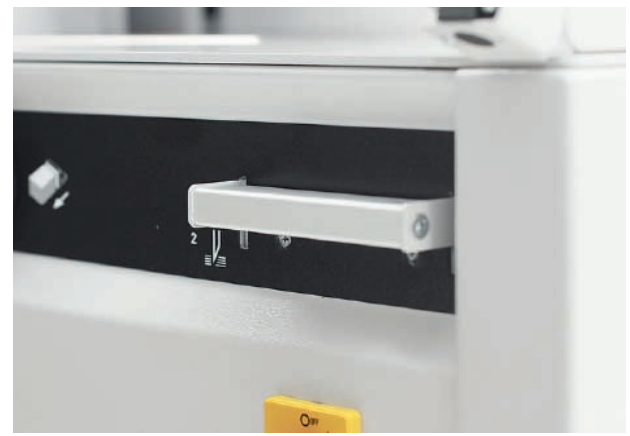
PATENTED TWO-STEP BLADE ACTIVATION BARS Blade and clamp can be activated independently with the two-step blade activation bars with separate trigger points for blade and clamp.

TOUCH PAD Convenient and easy-to-use electronic control module for the power back gauge includes a multilingual touch pad. 99 programs up to 99 steps can be stored in memory. Includes REPEAT CUT and EJECT functions.