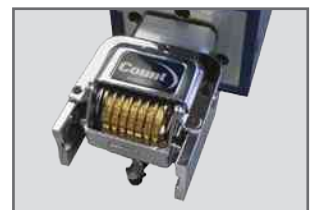
Numbering Head Wheel With Font Style Gothic (7)

The COUNT™ NumberPro is a basic hardworking solution for numbering, perforating and scoring on a wide range of paper stocks. Simple touchscreen programming allows you to number, perf (including micro-perf) or score individually or simultaneously. Number virtually anywhere up to 12 times per sheet, and add a second head for an additional 12 times – or crash number carbonless forms (up to 6 parts). Includes the patented self-inking cartridges to eliminate re-inking.