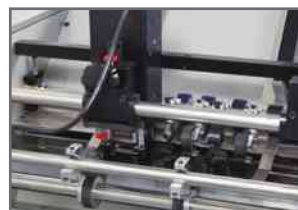
Capable of Using Two Numbering Heads

A numbering, perforating and scoring machine that's fast, easy to use and reliable.