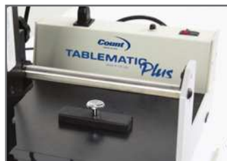
Magnetic Back Stop