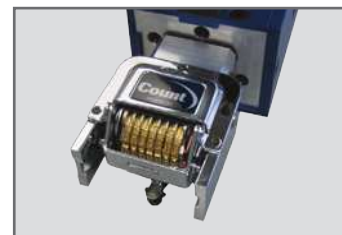
Numbering Head Wheel With Font Style Gothic (7)

The COUNT™ TableMatic Plus offers an easy, economical numbering solution that's ideal for small jobs that turn quickly. The TableMatic Plus can be used for crash numbering of NCR forms up to 6 parts, or numbering virtually anywhere on the paper. The simple foot pedal operation means anyone in your shop can use it, yet offers a range of features: drop zeros, a repeat function, numbering head pressure adjustment and a patented self-inking cartridge. Plus, a magnetic backstop and built-in side rails ensure consistently accurate registration.