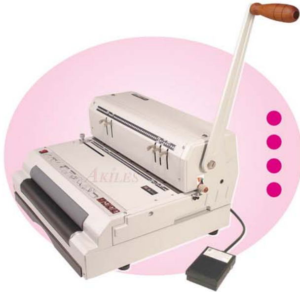
CoilMac-ECI (STANDARD version)