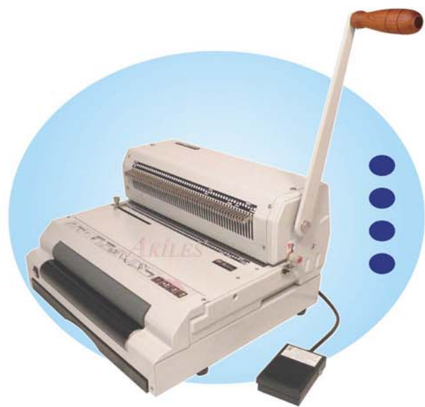
CoilMac-ECI+ (PLUS version)