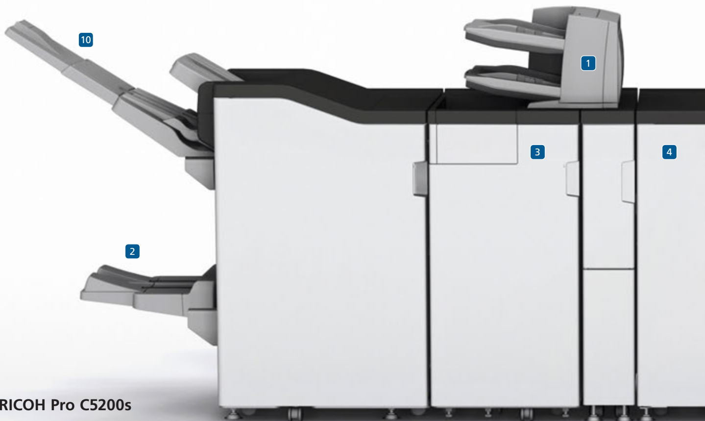
RICOH Pro C5200s