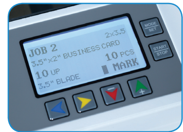
User-friendly LCD control panel