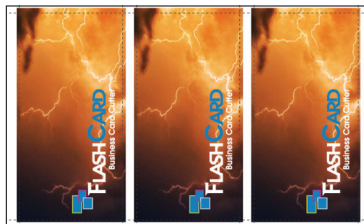
3-up 4.25" x 8" postcards Optional FC-20 - 8" Cassette