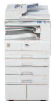
MP 2000SPF: Base model with standard copy, print, scan and fax capabilities, optional 50-sheet ARDF, standard 2 x 250-sheet and optional 2 x 500-sheet Paper Trays, standard One-bin Tray, plus optional Cabinet Stand.